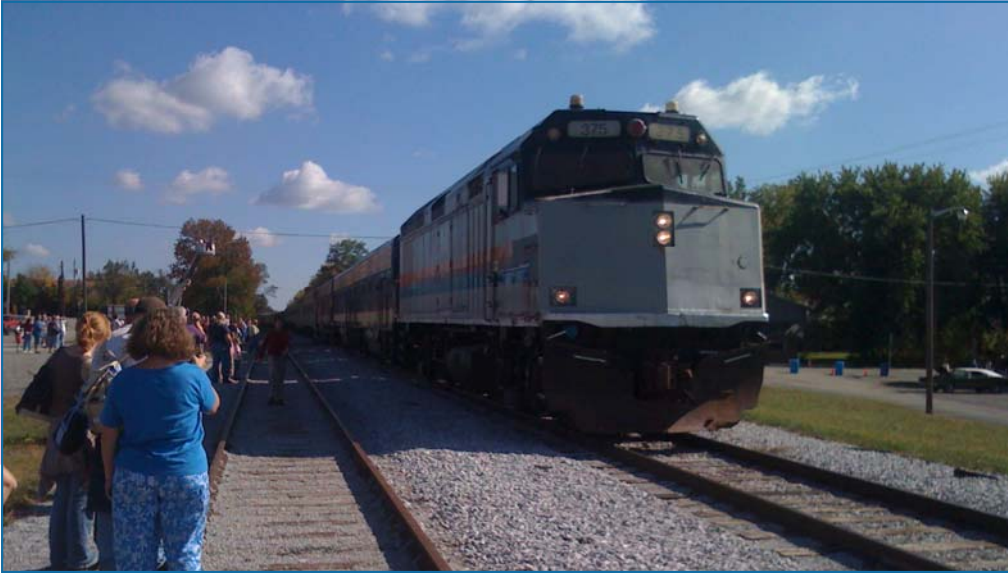
Left: Sunny shot of FP40PHR at Monterey, TN.