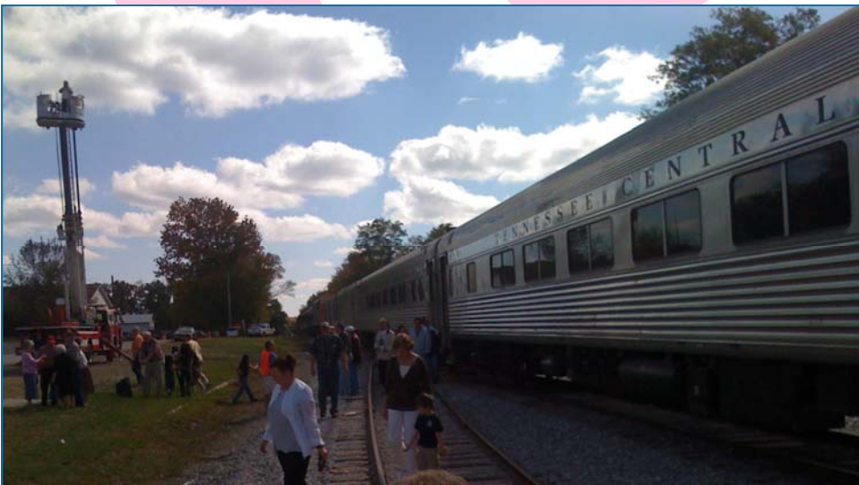
Left: At Monterey, TN, our train met an excited crowd of festival attendees who had not seen rail passengers in many years.