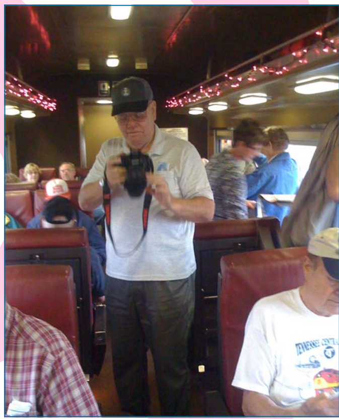
Riders relax for a trip through the TN countryside.

Motive Power included E8 6902, F7-Bs 715 and 719, and FP40PHR 375.