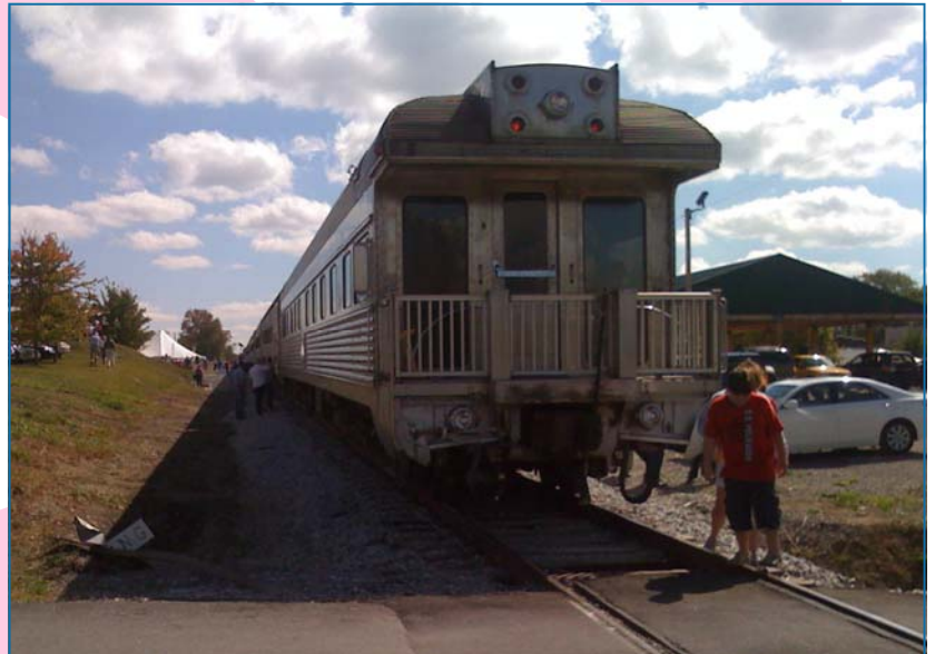
Right: TC 103, Observation Car (rebuilt SRR as Private Car/ Auto Train 9012) brings up the rear in Monterey.