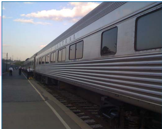
Our train is ready to depart the TC Museum, Nashville